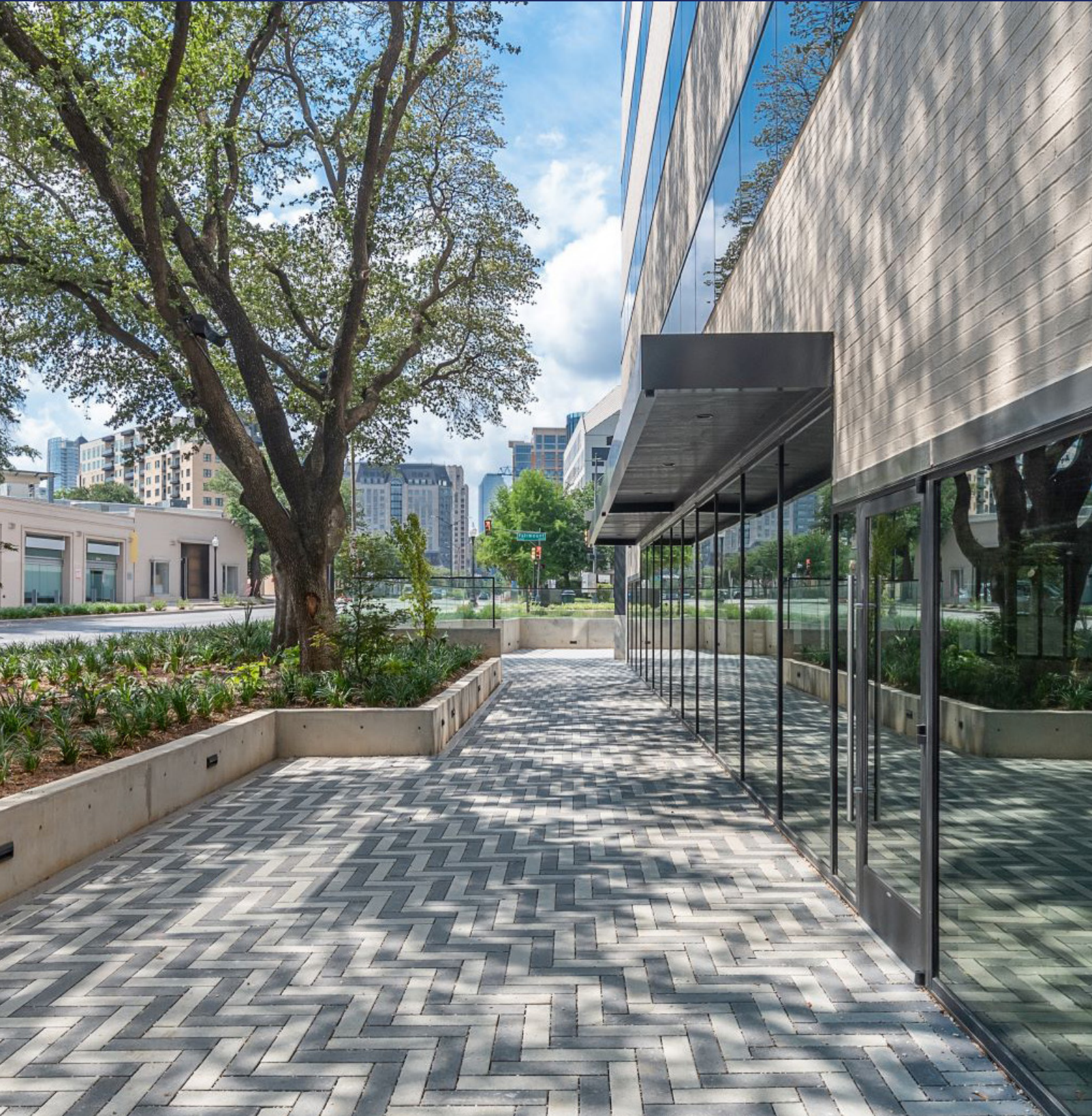
FIRST-FLOOR RESTAURANT SPACE WITH EXPANSIVE OUTDOOR PATIO