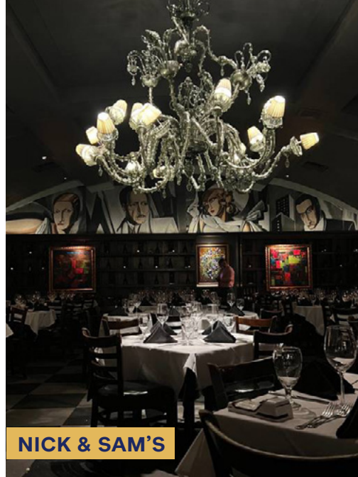
NICK & SAM'S