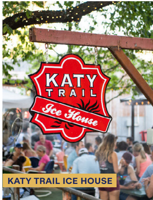
KATY TRAIL ICE HOUSE