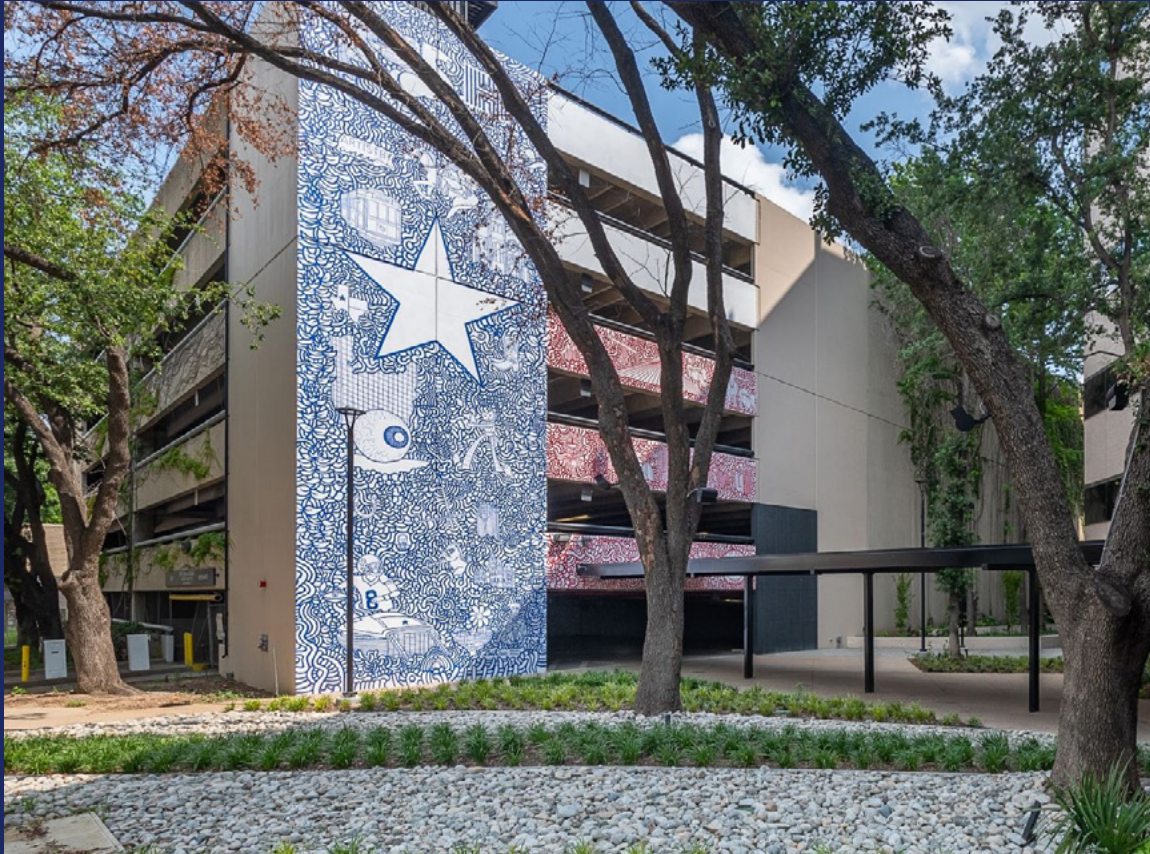
REFURBISHED EXTERIOR, PORTE-COCHÈRE, AND PARKING GARAGE